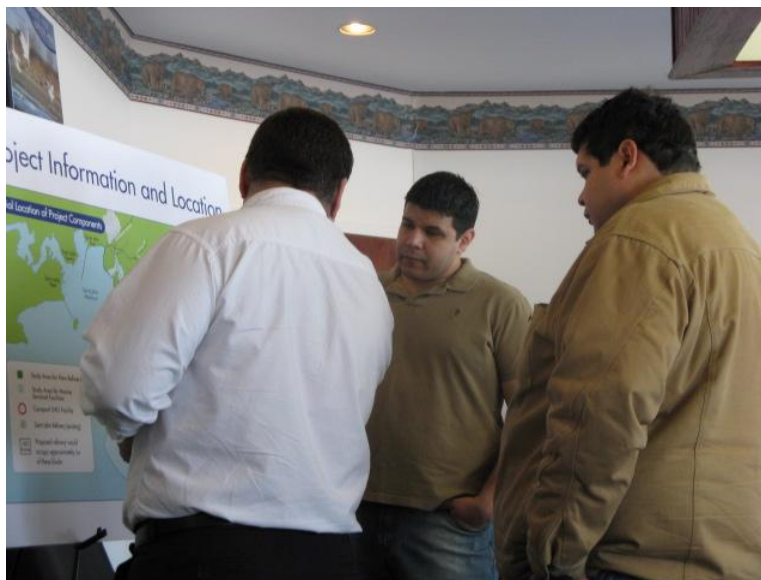
Figure 3.1 Typical Community Open House (Indian Island First Nation, March 18, 2008)

Participants were asked to sign a register to record attendance at each open house. Participants who requested additional Project information were asked to complete a feedback form prior to leaving the event. A typical open house set up is shown in Figure 3.1.